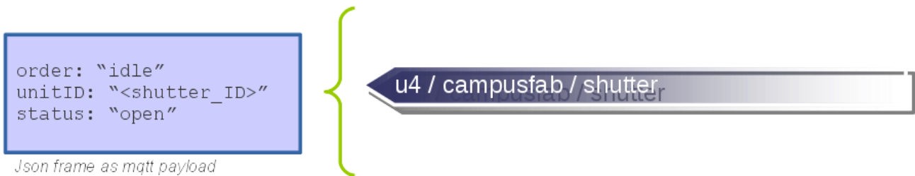
Json frame as mqtt payload

In the example above, a shutter identified by its 'unitID' sent back its status through the class topic.